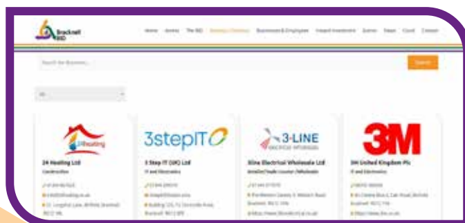
Bracknell BID website Business Directory