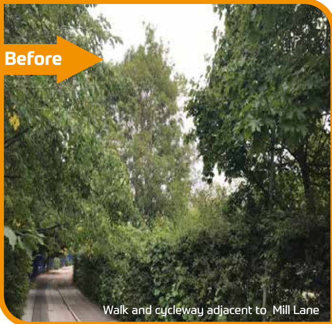
Walk and cycleway adjacent to Mill Lane