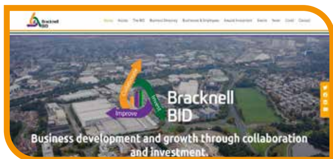
Bracknell BID website homepage

See bracknellbid.co.uk/bracknell-bid-monthly-virtual-drop-in-sessions/ for the zoom link and more info.